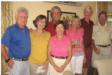
Social Golf Committee