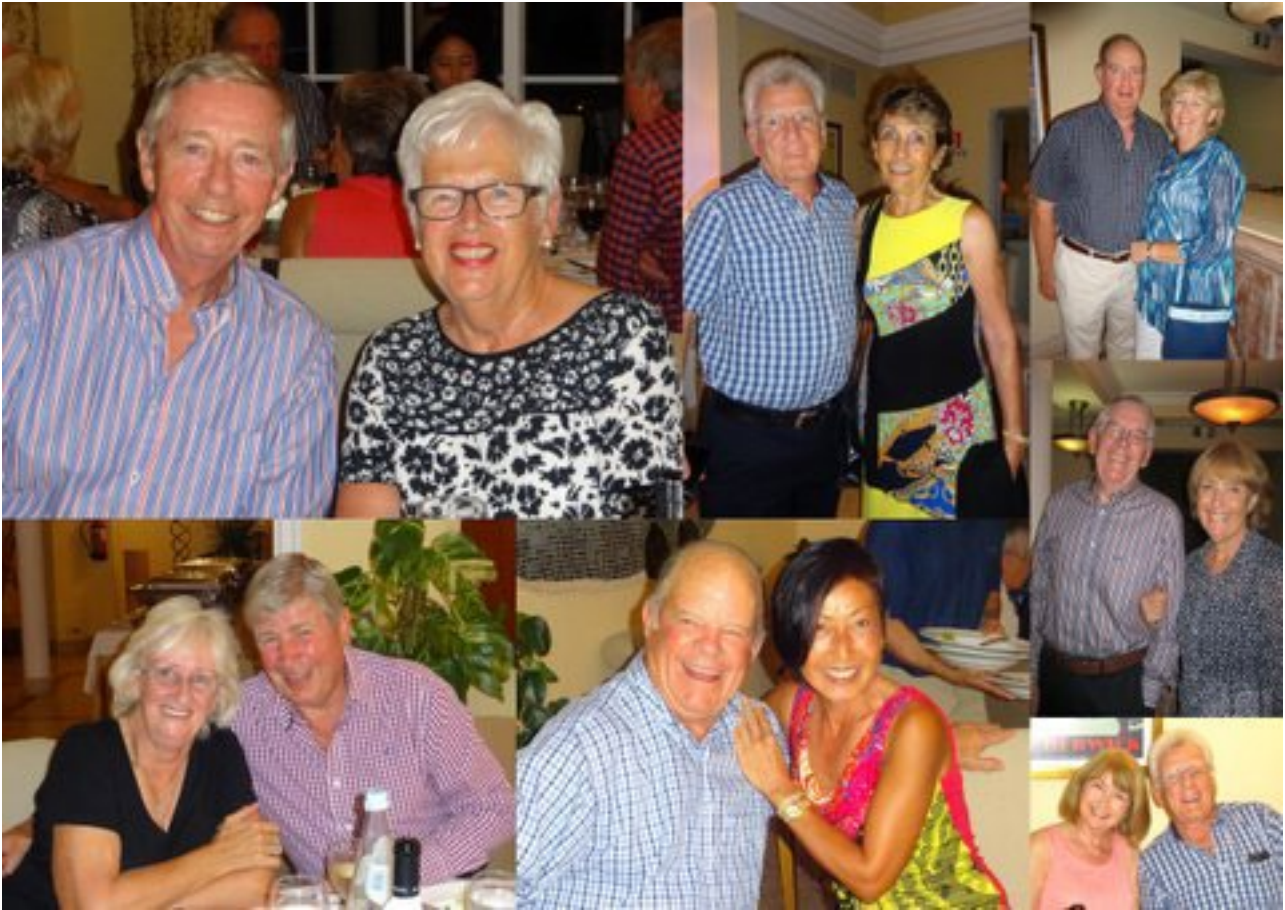
Wooden Spoon celebrations