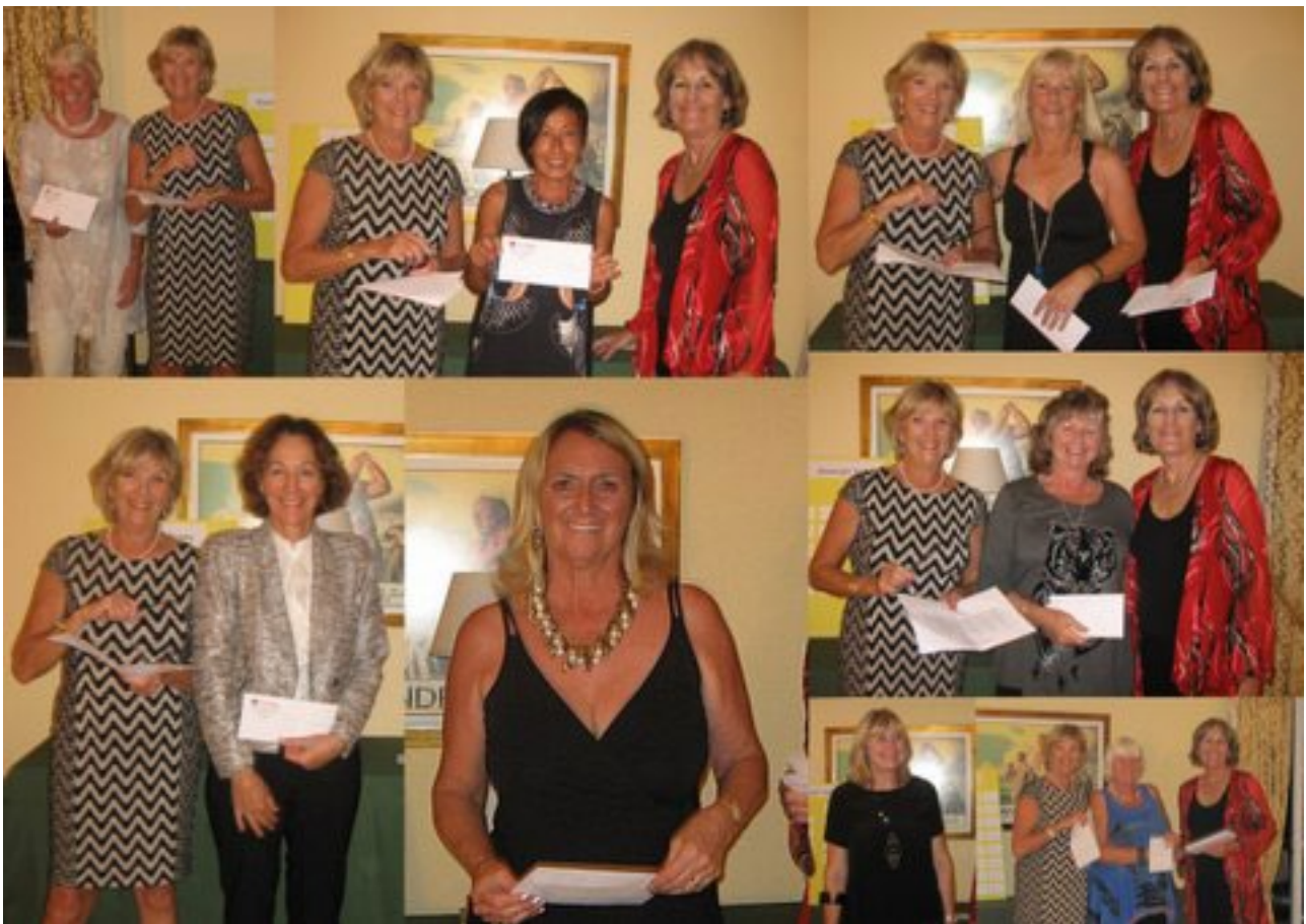
Eclectic Prize Winners