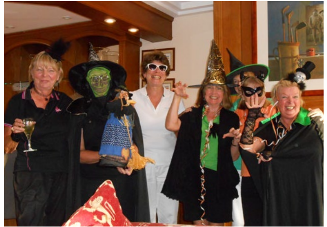
Ladies from Pinheiros Altos celebrating Halloween.